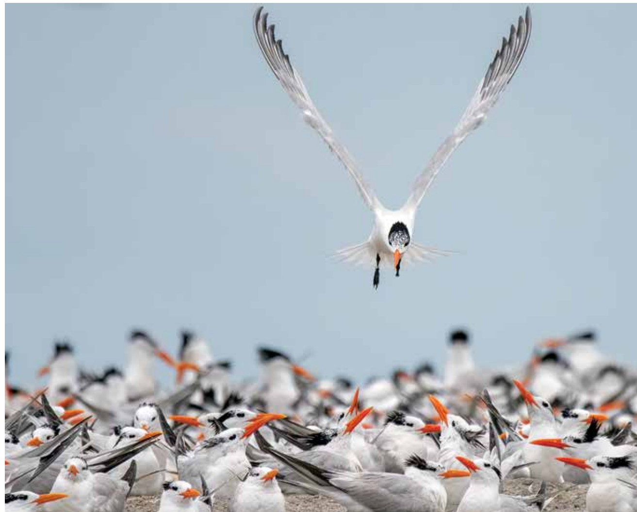
Right: A royal tern and its chick. Top: Dozens of royal tern chicks move together. Opposite: A royal tern looks for a place to land.