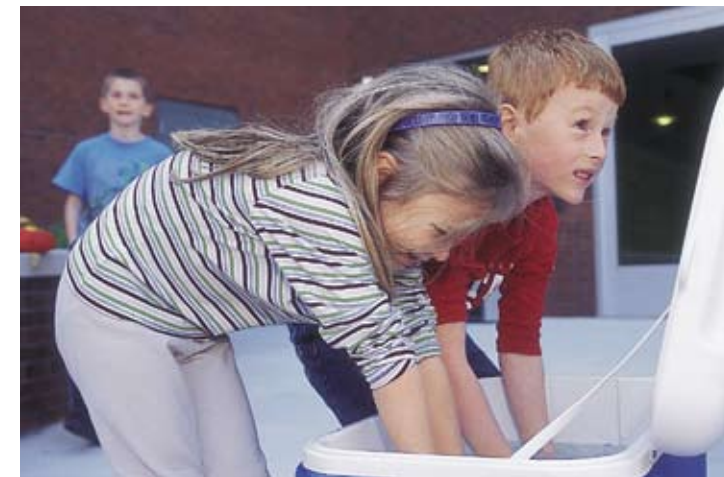
Kids dunk their hands in ice-cold water during a Cold Can Kill workshop.

The building has received national recognition for its ranking in the Leadership in Energy and Environmental Design rating system, the benchmark for green building evaluation. It also garnered a prestigious local award, the 2006 Sir Walter Raleigh Award for Community Appearance, in the institutional category, from the Raleigh City Council for its environmentally compatible, low-impact construction and operation. The judges noted that the structure and