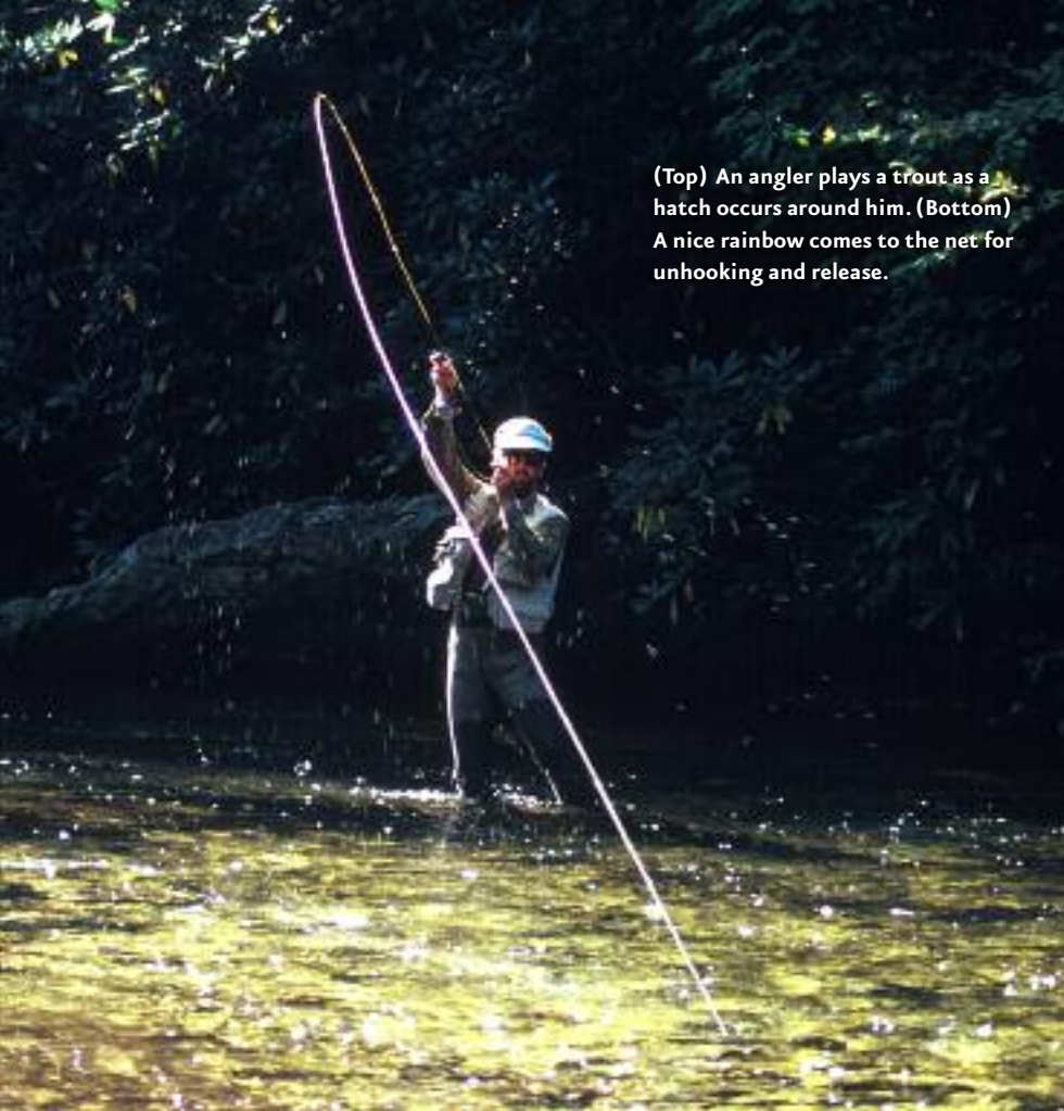
(Top) An angler plays a trout as a hatch occurs around him. (Bottom) A nice rainbow comes to the net for unhooking and release.