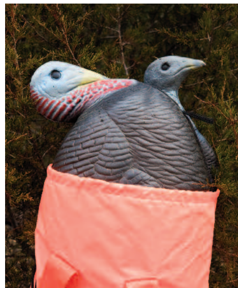
A set of decoys often includes a tom or jake with a hen, a setup that is meant to induce a nearby tom into investigating the interloper.

When he got about 100 yards out, the tom spotted the decoys and stopped to eye them. I could see him studying them as he cocked his head from one side to the other. He was standing in the early morning light with his feathers shimmering iridescently as the sun reflected off of them. It was a beautiful sight.