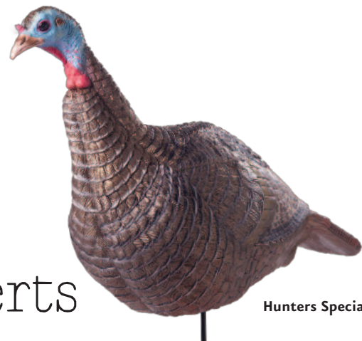
Hunters Specialties Suzie Snood Hen Decoy