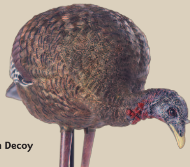
Primos Gobbstopper Jake Decoy