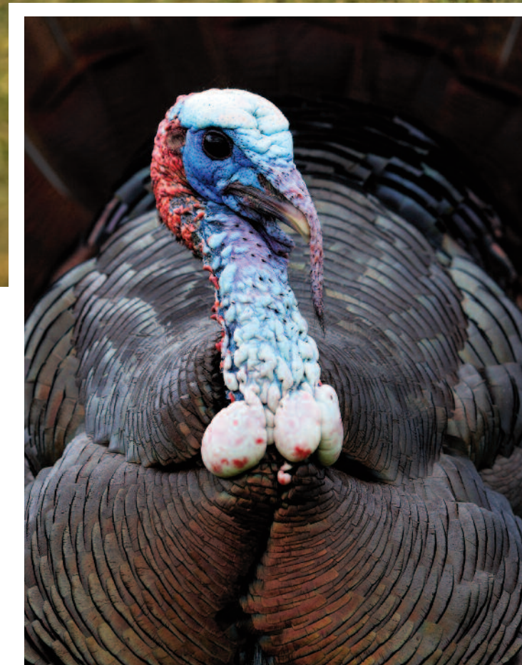
This trio of decoys features a jake on the left, a strutting tom in the middle and a hen on the right. Inset: This shot of a real tom shows the snood across the beak and the major caruncles at the bottom of its neck.

Decoys are especially effective when hunting fields and food plots where turkeys can spot them from a long distance away, allowing turkeys to essentially put a face to the voice. They also work well when hunting in the afternoon to set up and call sparingly, hoping to catch a bird sneaking in silently.