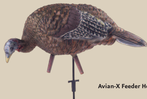
Avian-X Feeder Hen Decoy