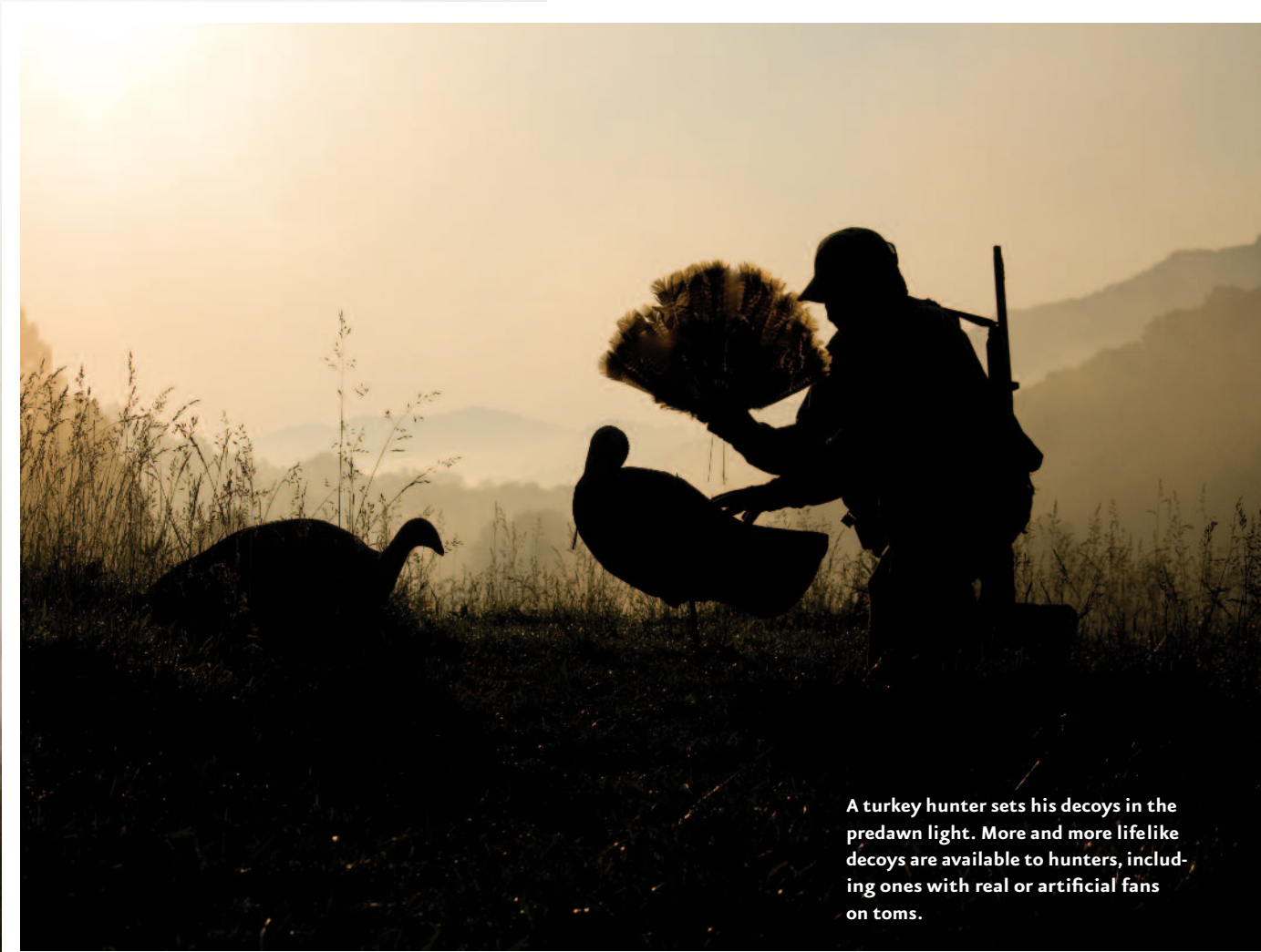
A turkey hunter sets his decoys in the predawn light. More and more lifelike decoys are available to hunters, including ones with real or artificial fans on toms.

This past season I began to think that a couple of new, better-looking decoys could be helpful when setting up in some of the small food plots on the property where I hunt. So I took a little road trip and looked at all of the