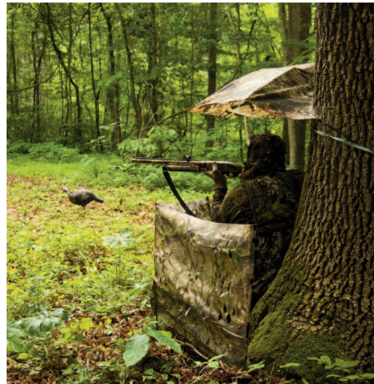
A commercial blind set up near a decoy spread allows a hunter some manner of movement and concealment during the hunt. With any luck, a mature tom will strut into view and go home with the hunter.