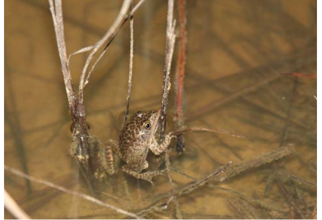
Head-started juvenile Gopher Frog released on to Holly Shelter Game Land