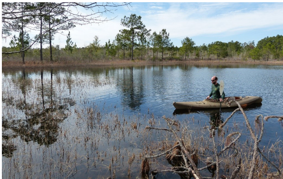
Staff surveying for gopher frogs on the Sandhills Game Land

Take or possession of this species without a valid permit is currently prohibited under NC law and administrative code (15A NCAC 10I .0102) and is considered a Class 1 misdemeanor (§ 113 337b). It is unlawful to release hatchery-raised fish on game lands without prior written authorization (15A NCAC 10D .0102), which could help prevent introduction of fish into ponds used by Gopher Frogs. Additionally, Commission regulations (15A NCAC 10B .0123) prohibit import, transport, export, purchase, possession, sale, transfer, or release into public or private waters or lands of the State, any live specimen(s) of Tongueless or African Clawed Frog ( Xenopus spp.; known carriers of the chytrid fungus Bd ), and several genera of Asian newts ( Cynops , Pachytriton , Paramesotriton , Laotriton , Tylototriton ; all known carriers of the chytrid fungus Bsal ).