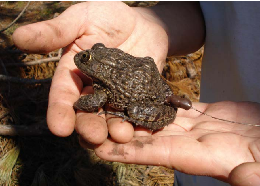
Gopher Frog with a transmitter for tracking purposes

The Commission will encourage private landowners with Gopher Frog habitat on their property to participate in the Wildlife Conservation Land Program. This program allows qualifying landowners whose property contains state listed species to get a break in property taxes for implementing conservation actions.