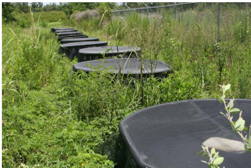
Gopher Frog head-starting tanks