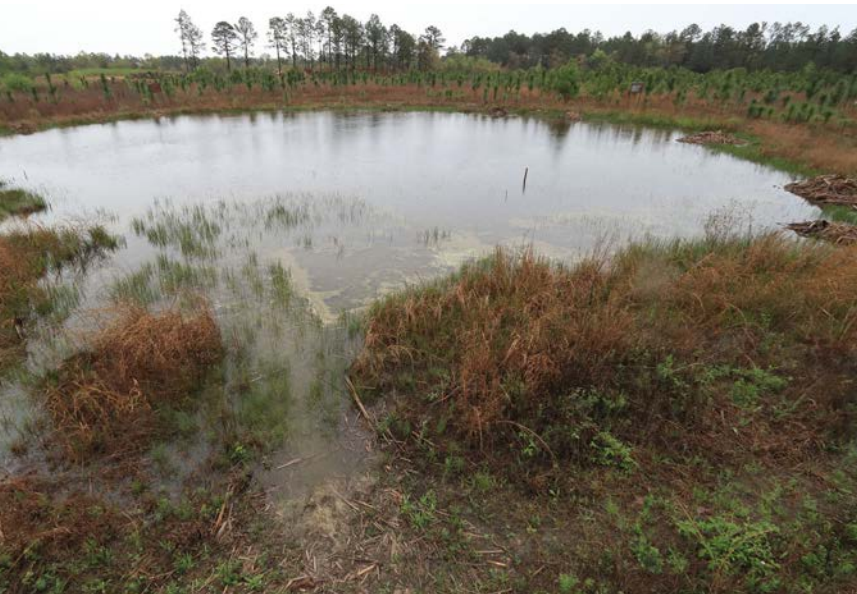
Wildlife Commission staff creating a new pond on the Sandhills Game Land in 2013 (top photo); the same pond in 2019 (Bottom photo: Mike Martin)

Commission staff and partners have also made great strides in wetland restoration and creation. Gopher Frogs prefer open canopy, herbaceous wetlands. In sites that have experienced infrequent fires or fires outside the late growing season, wetland shrub and tree canopies often develop. Commission staff on Sandhills Game Land and Holly Shelter Game Land, as well as DoD staff on MOTSU, and USFS staff on Croatan, have all worked toward opening the canopies of wetlands by harvesting trees, and in some cases, removing heavy duff layers in unburned wetlands. Commission staff on Sandhills Game Land also created a new pond in October 2013, specifically targeting use by the Gopher Frog. As of 2018, Gopher Frogs have bred in this artificially constructed wetland in at least two separate years.