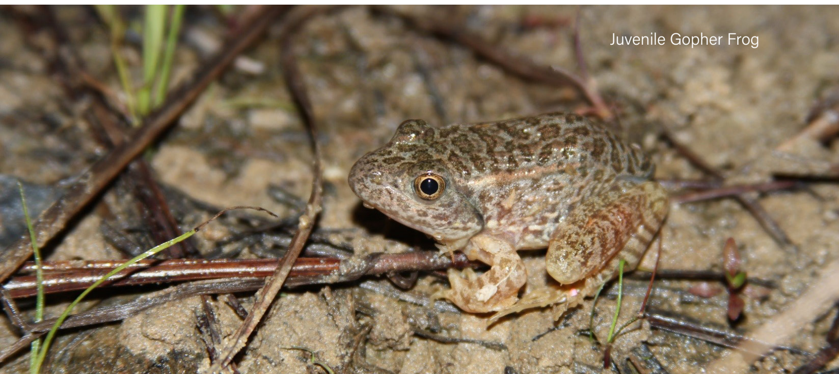
Juvenile Gopher Frog