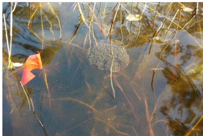
Gopher Frog egg mass