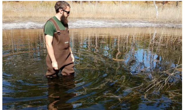
Surveying for Gopher Frogs