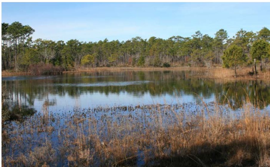
Gopher Frogs usually breed in isolated, fish-free, ephemeral wetlands

The Gopher Frog is associated with the Longleaf Pine ecosystem in the southeastern United States. This ecosystem is considered critically endangered, having been reduced by more than 98% (Noss et al. 1995). The Gopher Frog requires both appropriate breeding ponds and upland terrestrial habitat. Breeding ponds must be large enough to retain water throughout the tadpole stage, but shallow enough to dry periodically, because the Gopher Frog does not tolerate fish. Additionally, these ponds must be relatively open-canopy and have a heavy herbaceous component. Gopher Frogs deposit their egg masses on the stems of herbaceous