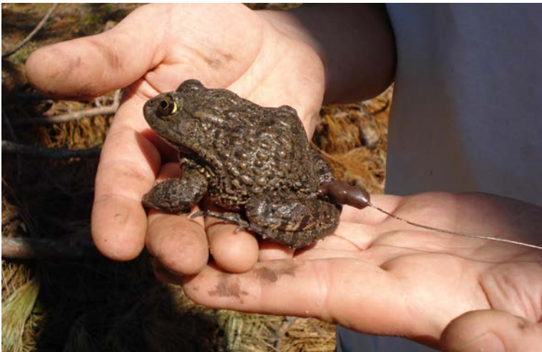
Gopher Frog with transmitter