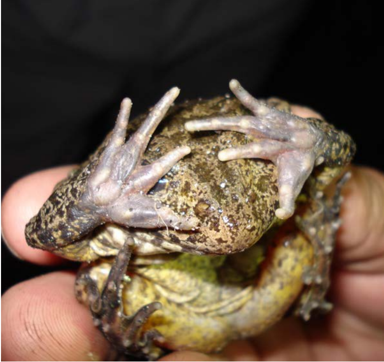
Gopher Frog in a "defensive" posture (Jeff Humphries)