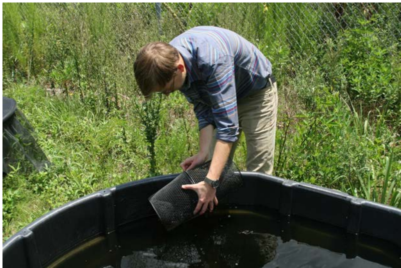
Checking for Gopher Frog metamorphs in minnow trap in head-starting tank