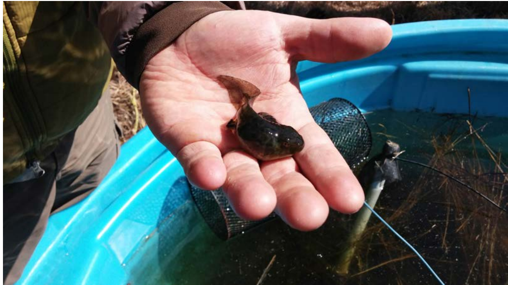
Gopher Frog tadpole

Breeding in North Carolina typically occurs from mid-February to mid-April, with most breeding occurring in March. Fall breeding also has been documented in North Carolina (Alvin Braswell field notes, WRC staff database). The breeding call is a loud snore that lasts up to two seconds (Wright and Wright 1949). Larvae develop over 3-4 months, and transformation usually occurs from May to July, when tadpoles grow larger than 85 mm in total length (Braswell 1995). The juveniles and adults occupy terrestrial habitats except for the intervals when adults migrate to breeding ponds. Longevity information is scant. One captive male reported in Snider and Bowler (1992) was from North Carolina and lived for 9+ years. Gopher frogs in Mississippi live at least 15 years in the wild (M. Sisson, pers. comm.). Based on one observation from Florida (Franz et al. 1988), Gopher Frogs can travel up to 2.0 km from their breeding sites. Research in North Carolina corroborates long-distance travel to breeding sites, with telemetered animals traveling an average of 1.3 km away from a Sandhills breeding site, and a maximum of 3.5 km (Humphries and Sisson 2012). In addition, during a separate project, a Gopher Frog from this same Sandhills breeding site was detected by drift fence, 5.2 km away. Thus, this species requires large tracts (typically >5,000 acres) of fire-maintained upland Longleaf Pine forest with embedded isolated ephemeral wetlands.