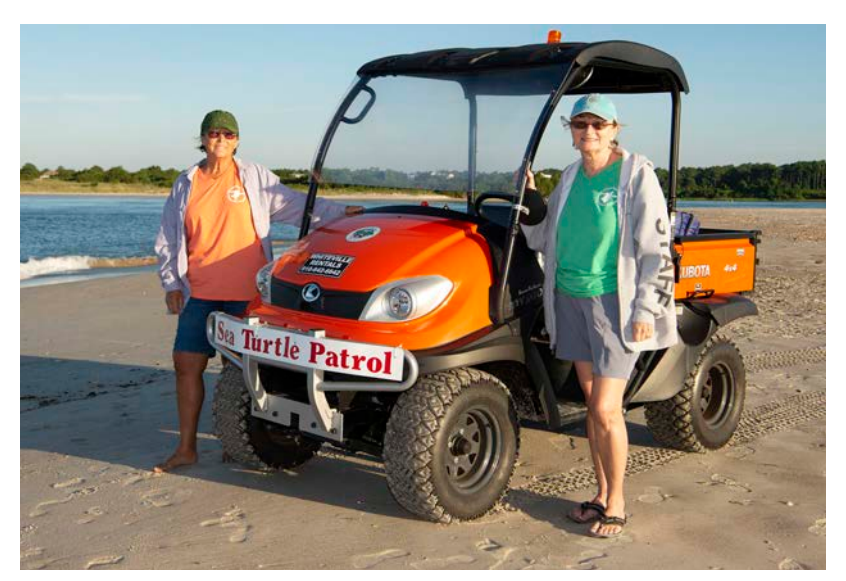
Volunteers play an immensely important role helping biologists monitor and protect sea turtles during nesting, egg incubation and hatchling emergence. (Melissa McGaw)

Around the same time that nesting beach monitoring projects were established, the NCWRC, in cooperation with the NOAA-NMFS, established the North Carolina Sea Turtle Stranding and Salvage Network (NCSTSSN) to respond to and document sick, injured, or dead sea turtles that were found along the coast. Many of the cooperators and volunteers who participate in the nest-