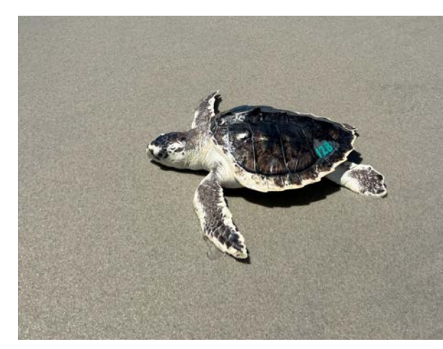
Rehabilitated Kemp's Ridley Sea Turtle being released into ocean