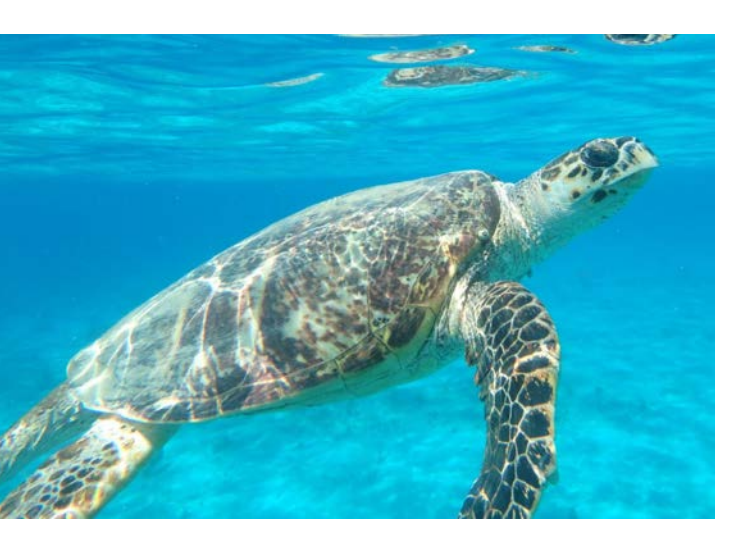
Hawksbill Sea Turtle (Julia Plasynski)

The Hawksbill Sea Turtle is a medium sized sea turtle and can reach a carapace length greater than 90 centimeters and weigh more than 90 kilograms. It has an elongated head and a distinctive beaked mouth that is the basis of its common name. The carapace has thick overlapping scutes that have a classic "tortoiseshell" coloration and have been used historically for jewelry, eyeglass frames, and other luxury items. The carapace has four pairs of costal (lateral) scutes and five vertebral scutes, and the posterior edges appear serrated. Adult males are characterized by an elongated tail that extends well beyond the end of the carapace; large, recurved claws on the front flippers; and a concave plastron. There is little difference in carapace length between adult males and adult females (Figgener et al. 2022). Juvenile Hawksbill Sea Turtles are not sexually dimorphic.