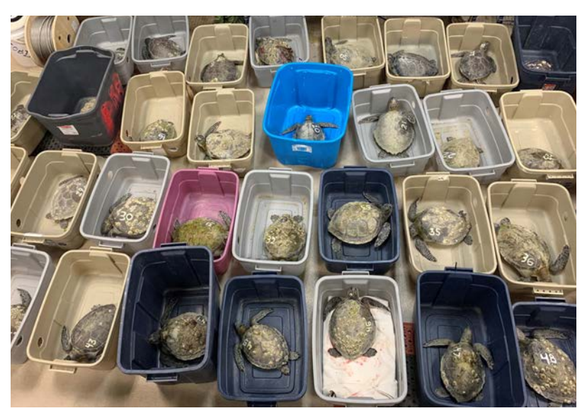
The number of cold-stunned turtles that need rescuing and rehabilitation may increase in the ensuing years, becoming more challenging to manage.

mittee. Additional in-water threats include impacts by vessels, impingement by hopper dredges, and risk of entanglement in passive gear associated with research. The Sea Turtle Advisory Committee was disbanded in 2016 by the NCMFC. It would be beneficial to establish a new review committee that expands its purview beyond assessing sea turtle interactions with fishing gear in estuarine waters to encompass all threats to sea turtles in state waters and address the lack of state authority to enforce rules to protect sea turtles in state waters. Potential members of the committee would be made up of stakeholders, including representatives of federal, state, county, and local governments; researchers; biologists; conservationists; NGOs; commercial fishers; and recreational anglers. The goal of this