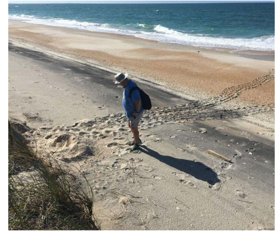
Daily morning patrols in the summer are conducted by volunteers and cooperators on North Carolina beaches, to find and protect freshly laid sea turtle nests. (Matthew Godfrey)

Most sea turtle eggs laid in North Carolina are from Loggerhead Sea