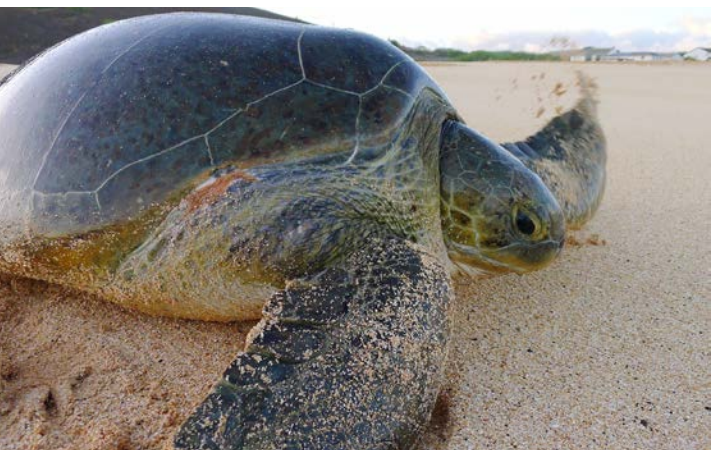
Green Sea Turtle (Matthew Godfrey)

The Green Sea Turtle can reach greater than 110 centimeters carapace length and weigh more than 175 kilograms. The Green Turtle has a small head with a serrated edge on its lower jaw. Juvenile and adult Green Turtles primarily eat seagrass or algae. The carapace is heart-shaped with four pairs of costal (lateral) scutes and five vertebral scutes. The name "Green Turtle" derives from the color of the internal fat that lines the body cavity. The carapace color ranges from light to dark brown, with or without mottled patterns. The plastron is white to yellow, although in some regions it may also be gray. Adult males are characterized by an elongated tail that extends well beyond the end of the carapace; large, recurved claws on the front flippers; and a concave plas-