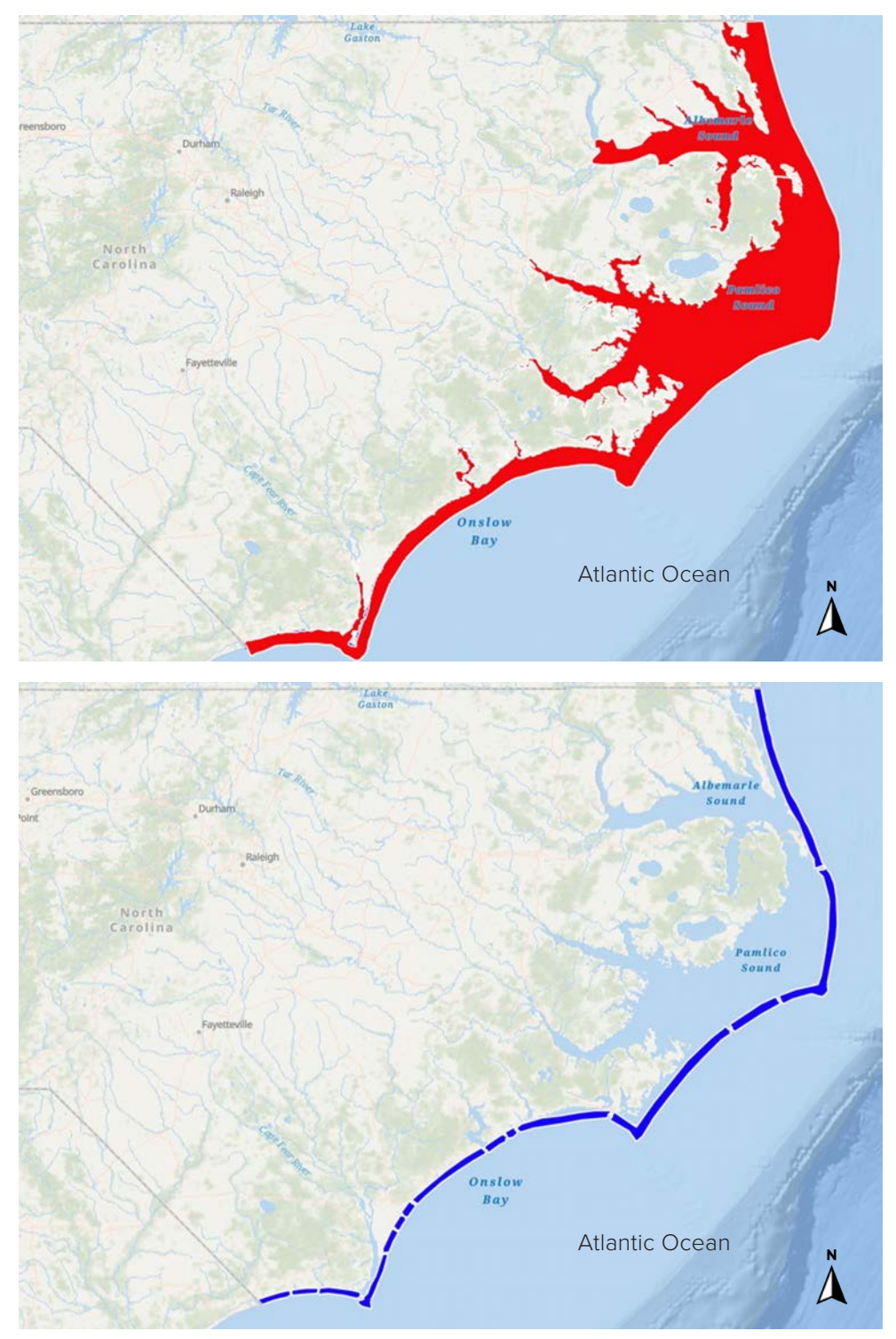
Habitats used by the Loggerhead ( Caretta caretta ), Green ( Chelonia mydas ), Kemp's Ridley ( Lepidochelys kempii ), Leatherback ( Dermochelys coriacea ), and Hawksbill ( Eretmochelys imbricata ) Sea Turtles in North Carolina, in estuarine and coastal state waters (top) and on ocean-facing sandy beaches along coastal barrier islands (bottom). Data come from the North Carolina Sea Turtle Stranding and Salvage Network and the North Carolina Sea Turtle Nesting database. Maps were created using the ESRI Mapmaker (https://www.arcgis.com/apps/instant/atlas/index.html).