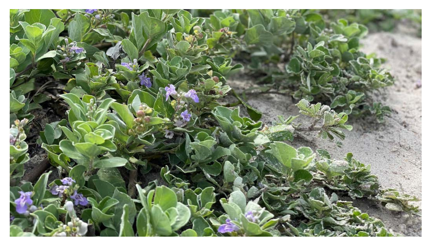
Among the conservation efforts to protect sea turtles and their nests is prohibiting the planting of invasive beach vitex on coastal beaches because of the negative impacts to sea turtle nests. (Jodie Owen)