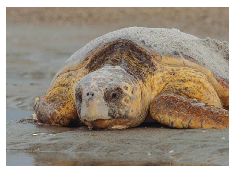
Loggerhead Sea Turtle (Jenn Merlo)

Linneaus described the species as Testudo caretta in 1758, based on a specimen from Bermuda or the Bahamas (Dodd 1988). Subsequently nearly three dozen binomial names were assigned to the species until 1873, when Leonhard Stejneger was the first to use Caretta caretta (Dodd 1988). Genetic evidence does not support the existence of subspecies of Loggerheads (Bowen 2003).