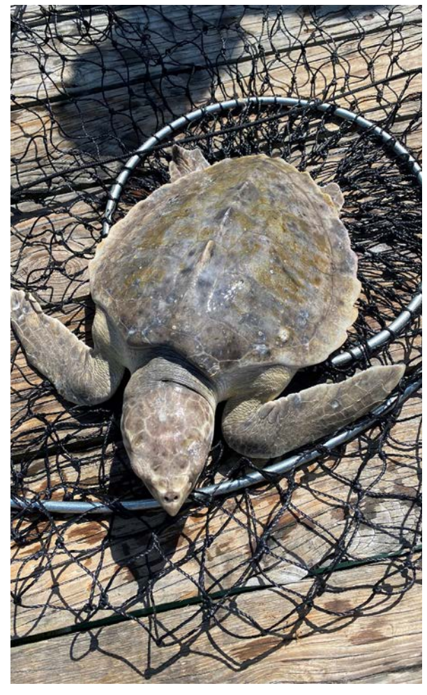
Interactions with recreational and commercial fishing gear are common in North Carolina, such as this Kemp's Ridley Sea Turtle incidentally captured by a hook and line angler on Jennette's Pier in Nags Head. The turtle was brought to the pier with a hoop net so the hook could be successfully removed.