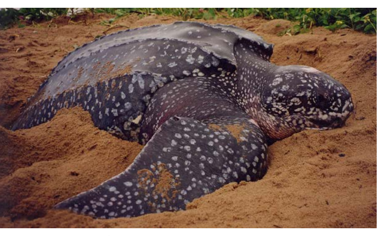
Leatherback Sea Turtle (Matthew Godfrey)

Sea Turtle. The species distinction between Olive and Kemp's Ridley Sea Turtles is fully supported by genetic evidence (Bowen et al. 1991). No subspecies of Kemp's Ridley Sea Turtles are currently accepted.