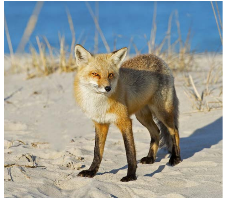
Red foxes (above), along with other predators such as unleashed dogs, coyotes and raccoons, are a major threat to incubating eggs. Wire mesh (below) placed over nests helps deter these predators.