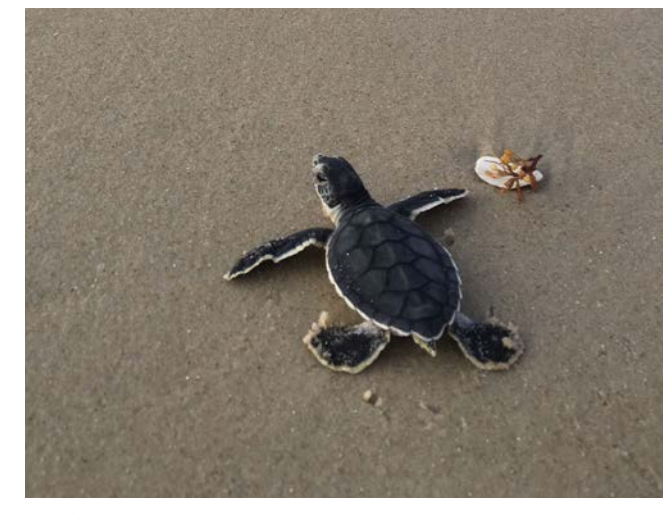
A Green Sea Turtle hatchling approaches the ocean after leaving its nest on Cape Lookout National Seashore. (Matthew Godfrey)

Green Sea Turtles are globally distributed, with nesting occurring in tropical, subtropical, and some temperate beaches in the North and South Atlantic Oceans (including the Mediterranean Sea), North and South Indian Oceans, and the Western, Central, and Eastern Pacific Oceans. In the Atlantic Ocean, they occur as far south as Argentina and as far north as Canada and the United Kingdom. Small juvenile Green Sea Turtles (25- to 40-centimeters carapace length) are the most common life stage found in both coastal and estuarine waters of North Carolina between April and December, or when water temperatures remain above 11 °C (Braun-McNeill et al. 2008). These juveniles generally forage in seagrass beds in shallow estuarine areas in North Carolina (McClellan et al. 2009). Green Sea Turtle nests have been documented on every barrier island on the coast of North Carolina from May to September, with emergent hatchlings produced from July to October or early November.