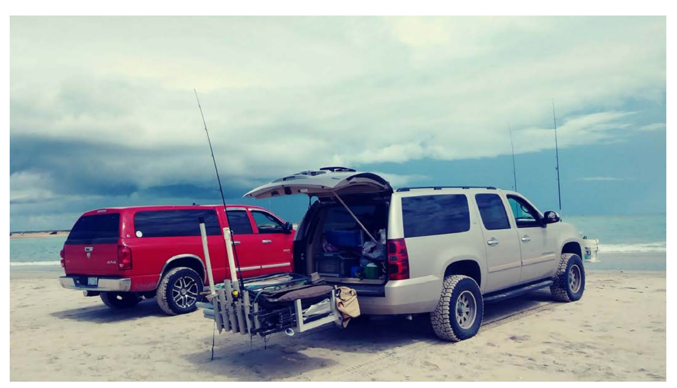
The National Park Service at Cape Hatteras National Seashore Off-Road Vehicle Management Plan restricts nighttime driving during the nesting season as well as controls vehicle access around known incubating sea turtle eggs.

In 2012, the National Park Service at Cape Hatteras National Seashore established an off-road vehicle (ORV) management plan for the protection of sea turtles that occur on the beach, including nesting females, incubating eggs, and emergent hatchlings (77 FR 3123). Management actions include restricting nighttime ORV use during the nesting season and controlling ORV access around known incubating sea turtle eggs. The Marine Corps Base Camp Lejeune has an Integrated Natural Resources Management Plan (INRMP; expired 2020 but in effect until updated) that identifies management actions to minimize impacts of the military presence at the base on sea turtles that occur on its beaches. These actions include reducing visible artificial light on the beach and/or use of lights with wavelengths less likely to affect the behavior of sea turtles on the beach; restricting recreational driving on the beach during the nesting season; relocation of eggs away from the amphibious training area; and nighttime monitoring of the nesting beach during nighttime training activities elsewhere. These management activities continue while a new INRMP is being developed.