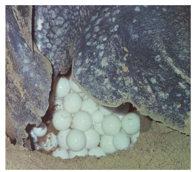
Leatherback Sea Turtle nests are relatively rare in North Carolina, accounting for only 0-8 nests per year. (Matthew Godfrey)

The species is considered to have been greatly reduced relative to historical levels, due to incidental capture in fishing gear, directed harvest, ocean pollution, and reduction or loss of suitable nesting habitat. The Leatherback Sea Turtle was listed as Endangered in 1970 under the Endangered Species Act (FR Doc. 1970-16173). In 2020, the NOAA-NMFS and USFWS determined that sufficient information was available to identify seven different Leatherback Sea Turtle populations as DPSs, including the Northwest Atlantic DPS that includes Leatherback Sea Turtles in North Carolina (NMFS & USFWS 2020). Currently Leatherback Sea Turtles remain listed as Endangered throughout their range under the Endangered Species Act. In North Carolina, Leatherback Sea Turtles are listed as Endangered (15A NCAC 10I .0103(a)(7)(C)).