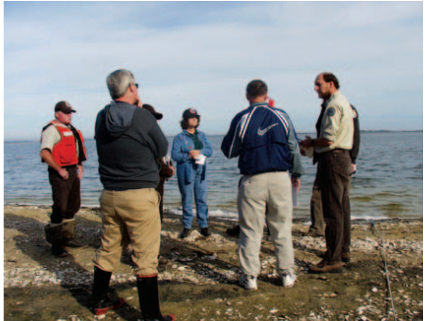
A Wildlife Commission biologist and volunteers prepare to survey nesting birds.