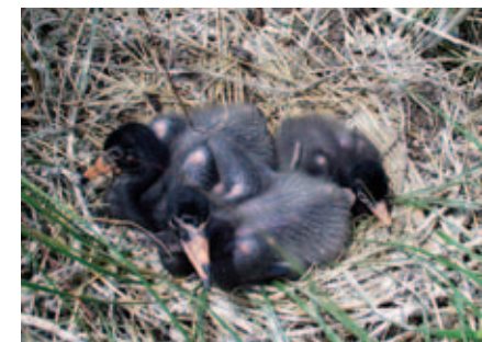
White ibis adults and chicks.