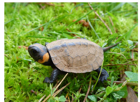
Bog turtle hatchling