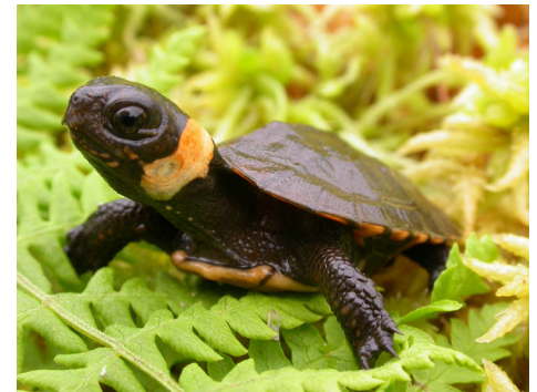
Bog turtle hatchling

Typically between six to 10 years but can live up to 50 or 60 in protected habitats.