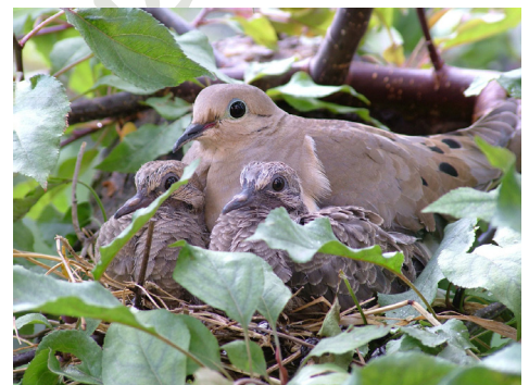
Mourning dove with young

55 to 75 percent of juveniles do not survive first year. Adult mortality is about 55 percent annually.