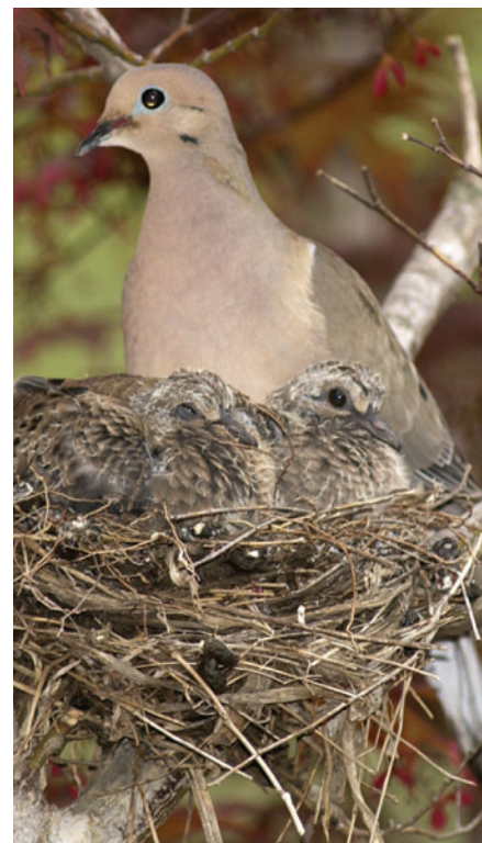
Jim Rathert / Missouri Department of Conservation

2007 or later — Initiation and evaluation of appropriate regulation changes based on approved regional harvest management plans. [Technical committees, flyway councils, FWS]