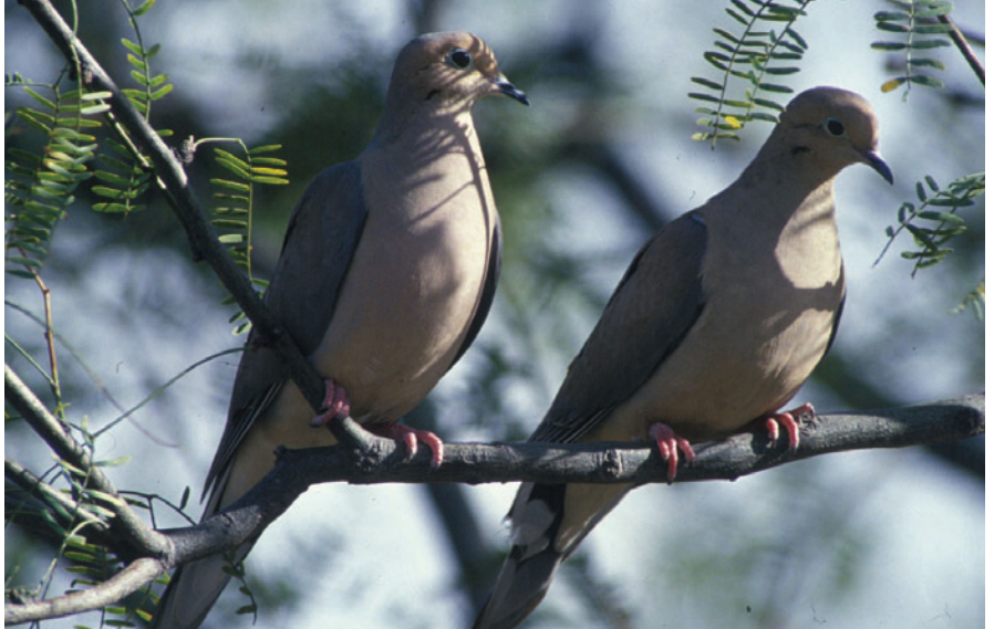
George Andrejko / Arizona Game & Fish Department

The goal and objective of this plan will be fulfilled when (1) harvest management strategies are developed and management plans prepared for each of the 3 management units that include decision criteria that explicitly state when regulatory changes will be made, what the changes will be, and the estimated effect of regulatory options, and (2) harvest management strategies, decision criteria, regulatory changes, and estimated effects are based on an understanding of current harvest and demographic parameters and their relationships.