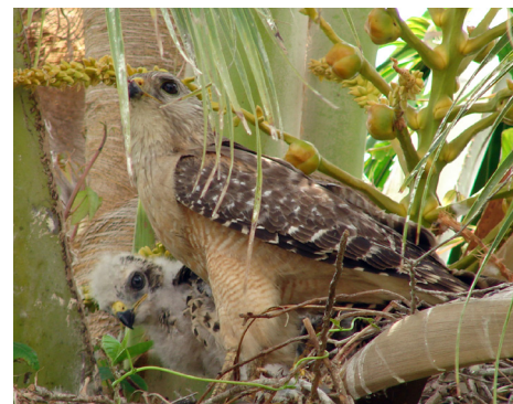
Red-shouldered hawk with chick.

50 to 80 percent of young die within first year. Adult mortality is about 20 to 40 percent annually.