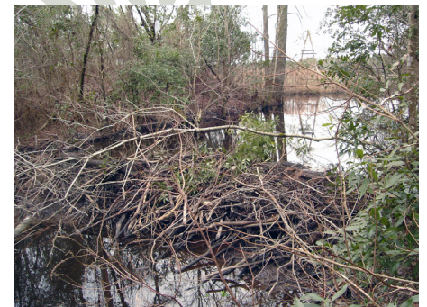
Beaver dam (NCWRC)

May live 20 years, but usually half that or less.