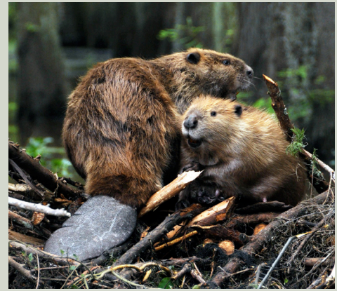
U.S. Fish & Wildlife Service

The beaver is nicknamed “nature’s architect”