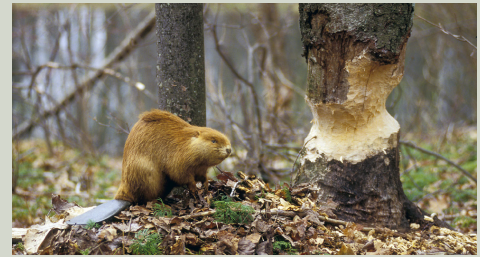
U.S. Fish & Wildlife Service