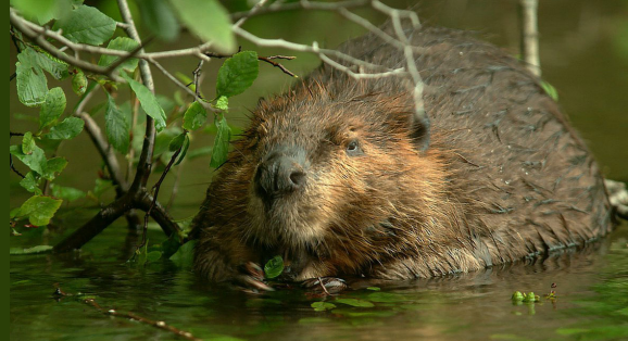
U.S. Fish & Wildlife Service