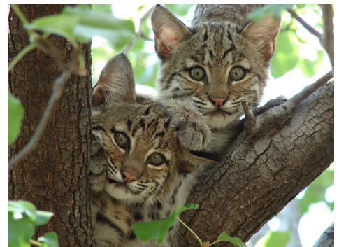
Bobcat kittens

Average 3-4 years for males and 4-5 years for females. Few live longer than 10 years.