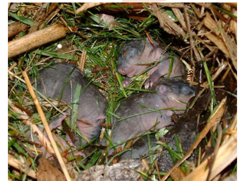
Muskrat kits