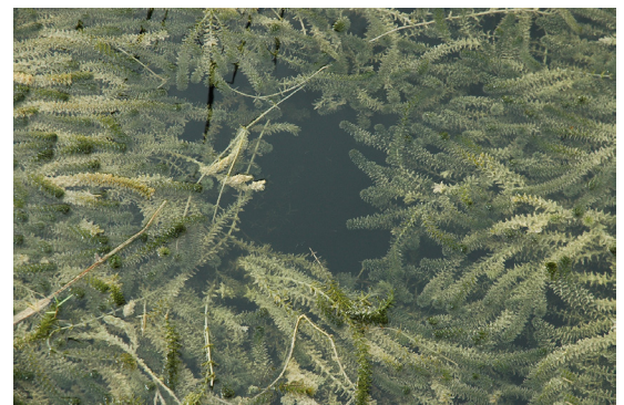
Figure 2. Hydrilla underwater