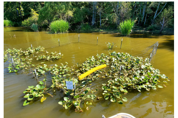
Figure 4a: Close-up view of a fenced enclosure to protect beneficial vegetation from herbivores (NCWRC)