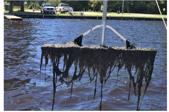
Figure 3: Lyngbya (Mark A. Heilman)