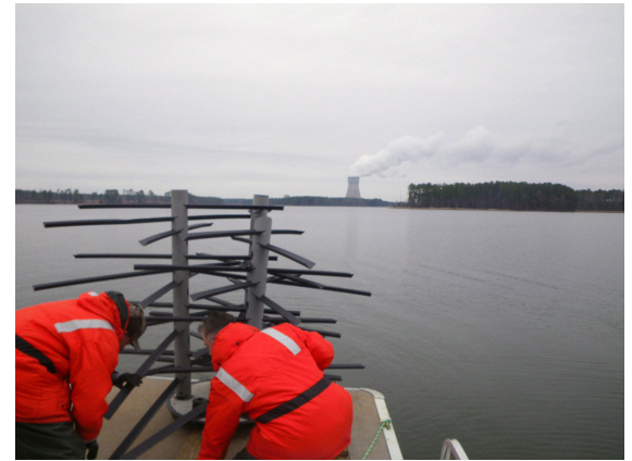
Figure 5: Example of fish attractors being placed into Harris Lake (NCWRC)