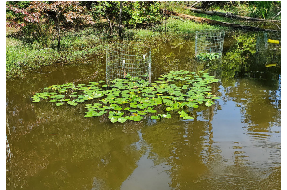
Figure 4: Example of a fenced enclosure to protect beneficial vegetation from herbivores (NCWRC)