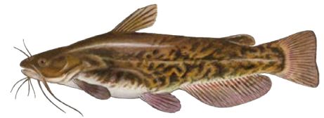
Brown Bullhead