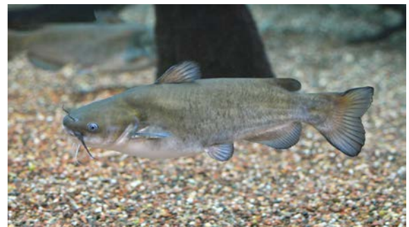
White catfish