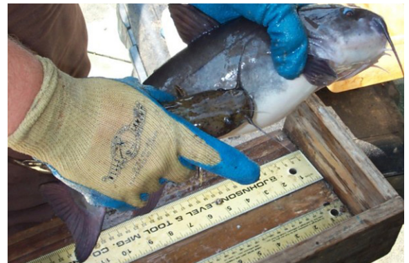
A N.C. Wildlife Resources Commission biologist measures the length of a White Catfish on the New River, NC.