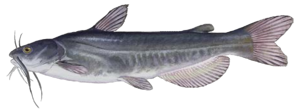
White Catfish (Duane Raver/USFWS)