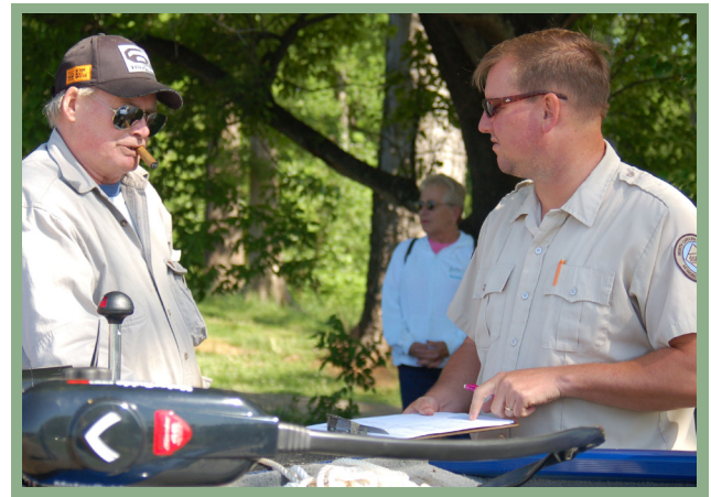
Conducting a creel survey

In order to determine a dollar value associated with this recreational fishery, anglers were asked how much money they spent per trip on things such as bait, food, gas and lodging. Anglers who fished the Cape Fear River during the year long creel survey spent an average of $20.84 per trip. When this number was expanded over the 12-month study period, we estimated that these expenses exceeded $392,000. This figure does not include the cost of boats, motors, vehicles and other major accessories.