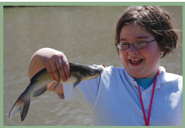
Young angler holds a channel catfish

For example, the striped bass stock in the Cape Fear is currently considered significantly diminished. A Fisheries Management Plan has been developed to identify critical issues affecting stock expansion and to provide strategies for stock recovery.