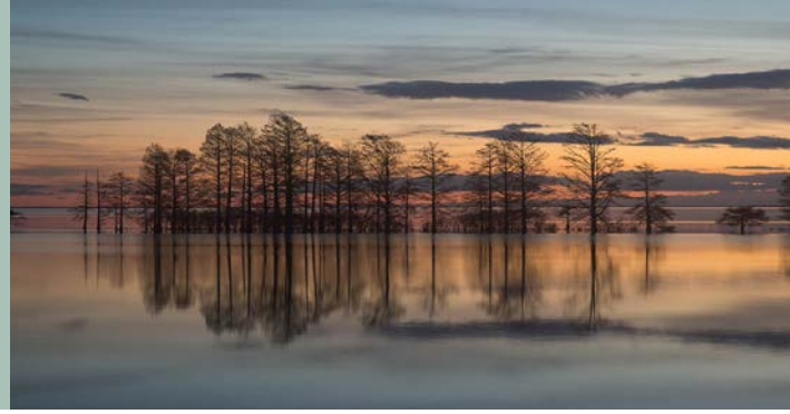
Lake Mattamuskeet (Thomas Harvey)

The N.C. Wildlife Resources Commission (NCWRC) is conducting a stocking evaluation for Largemouth Bass at Lake Mattamuskeet. Since 2013, annual surveys at Lake Mattamuskeet revealed a relative absence of young-of-year Largemouth Bass in the presence of abundant 12–15-inch fish. The lack of fish less than 8 inches was hypothesized to be a result of reduced reproductive success or poor recruitment and was at least partially attributed to drought conditions in certain years that restricted access to shoreline habitats necessary for successful spawning and rearing for sport fish. Due to concerns regarding unsuccessful spawning, NCWRC stocked Largemouth Bass fingerlings from 2003 to 2007. These stocking events were not formally evaluated, as hatchery origin fish could not be discerned from Largemouth Bass of wild origin. To address the lack of young-of-year fish in more recent surveys at Lake Mattamuskeet, staff initiated a three-year stocking program in 2014, with a goal of stocking 20,000 fingerlings (1-2 inches) per year. To evaluate efficacy of the stocking program, biologists genotyped broodfish fin clips and used parentage-based tagging (PBT) analysis techniques to match stocked individuals with broodfish. Thus, all bass captured from the lake can be genetically compared with hatchery parents to determine which fish originated from stocking and which ones were born in the lake.