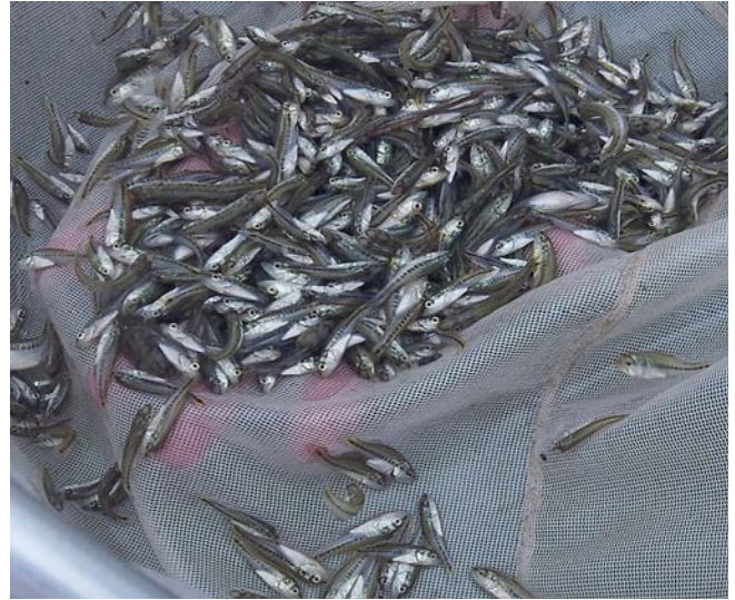
A net full of Largemouth Bass fingerlings being released into Lake Mattamuskeet.

The N.C. Wildlife Resources Commission (NCWRC) is conducting a stocking evaluation for Largemouth Bass at Lake Mattamuskeet. Since 2013, annual surveys at Lake Mattamuskeet revealed a relative absence of young-of-year Largemouth Bass in the presence of abundant 12–15-inch fish. The lack of fish less than 8 inches was hypothesized to be a result of reduced reproductive success or poor recruitment and was at least partially attributed to drought conditions in certain years that restricted access to shoreline habitats necessary for successful spawning and rearing for sport fish. Due to concerns regarding unsuccessful spawning, NCWRC stocked Largemouth Bass fingerlings from 2003 to 2007. These stocking events were not formally evaluated, as hatchery origin fish could not be discerned from Largemouth Bass of wild origin. To address the lack of young-of-year fish in more recent surveys at Lake Mattamuskeet, staff initiated a three-year stocking program in 2014, with a goal of stocking 20,000 fingerlings (1-2 inches) per year. To evaluate efficacy of the stocking program, biologists genotyped broodfish fin clips and used parentage-based tagging (PBT) analysis techniques to match stocked individuals with broodfish. Thus, all bass captured from the lake can be genetically compared with hatchery parents to determine which fish originated from stocking and which ones were born in the lake.