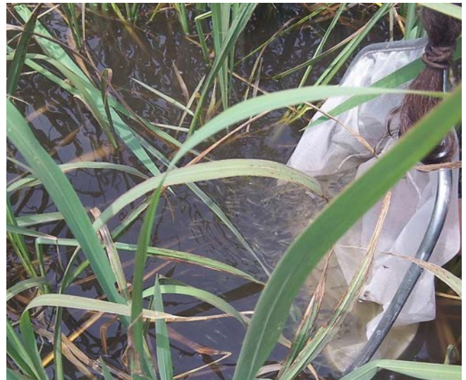
Largemouth Bass fingerlings being released into suitable habitat at Lake Mattamuskeet.