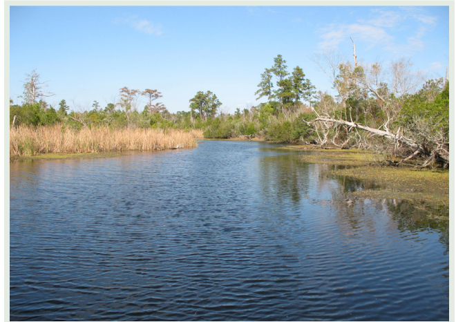
A typical marshy area of the lower New or White Oak River where N.C. Wildlife Commission staff collected most of the large sunfish.

Staff collected 16 different fish species on the New River including bluegill, largemouth bass, pumpkinseed, redear sunfish and juvenile spot and pinfish. On the White Oak River, they collected 13 species, including bluegill, largemouth bass, pumpkinseed, redbreast sunfish and redear sunfish.