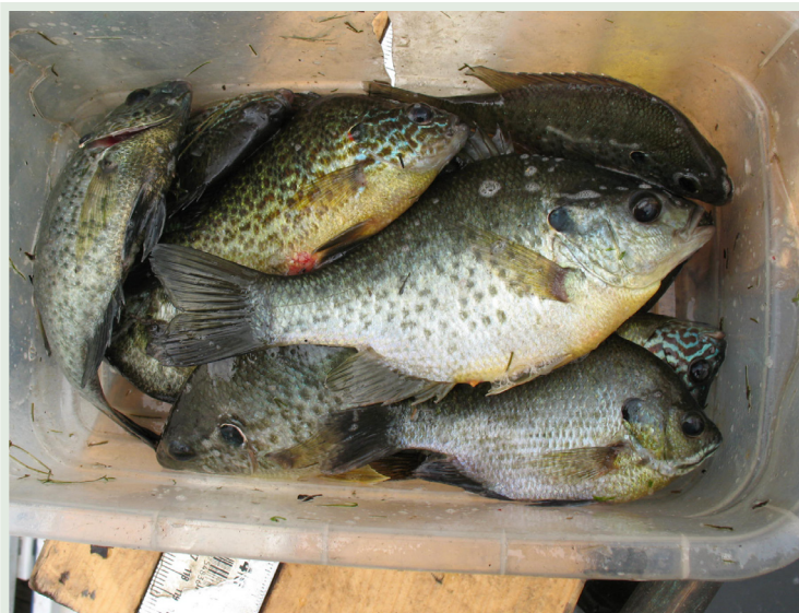
An example of the large bluegill, pumpkinseed, and redear sunfish in the New and White Oak rivers.

In general, bluegill, pumpkinseed, and redear sunfish were larger on the New River than the White Oak River with 7- to 9-inch fish abundant in samples. Bluegill on the White Oak River were smaller; however, several 6- to 9-inch redear sunfish were collected. Staff also collected about 40 redbreast sunfish in the upper end of the White Oak River, the biggest of which approached 7 inches in length. Largemouth bass 12 to 14 inches in length made up the majority of sample on both rivers, and only about 20–25 percent of the catch consisted of largemouth bass larger than 14 inches. Condition (how skinny or plump a fish was) of bluegill, pumpkinseed and redear sunfish on both rivers was high. For largemouth bass, especially the ones bigger than 14 inches, condition was lower than optimal.