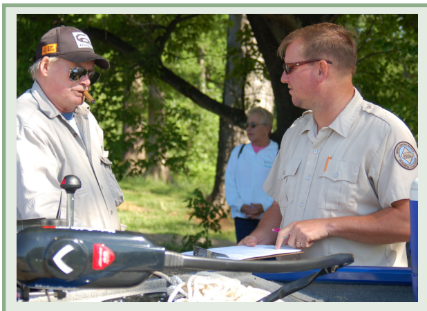
Conducting a creel survey

As was expected, catch and release practices were highest among largemouth bass anglers. However, almost 13,000 (or 28 percent) of the bass caught were kept by anglers.