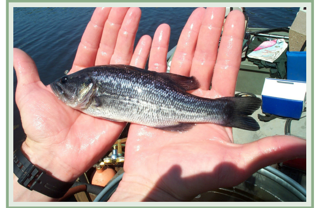
8-inch largemouth bass

“Regional” anglers accounted for 37 percent of the fishing parties, and were defined as those anglers living in the remaining counties of North Carolina or in the southeastern Virginia counties of Chesapeake, Virginia Beach, Suffolk, Isle of Wight and Southampton.