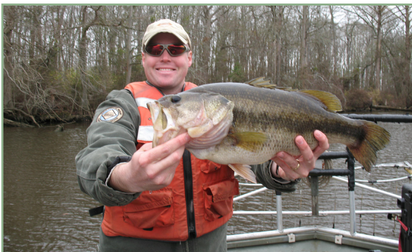
In coastal rivers where bass growth is slow, few fish will reach this size. However, improvements in growth rates and average size can be achieved using angler harvest as a management tool.

In any aquatic system, the absence of big bass can be the result of several factors. If you assume that big bass are old bass (sometimes true, but not always), then you might believe that mortality has removed the big bass from the population. This may be true in systems that experience high rates of angler harvest, excessive movement of tournament-caught bass, extremely toxic water quality, or rapid consumption of bass by other predators. In fact, high rates of bass harvest by anglers 30-plus years ago resulted in the need for harvest restrictions designed to protect bass long enough for them to grow to a quality size. The absence of big bass may also be related to growth patterns.