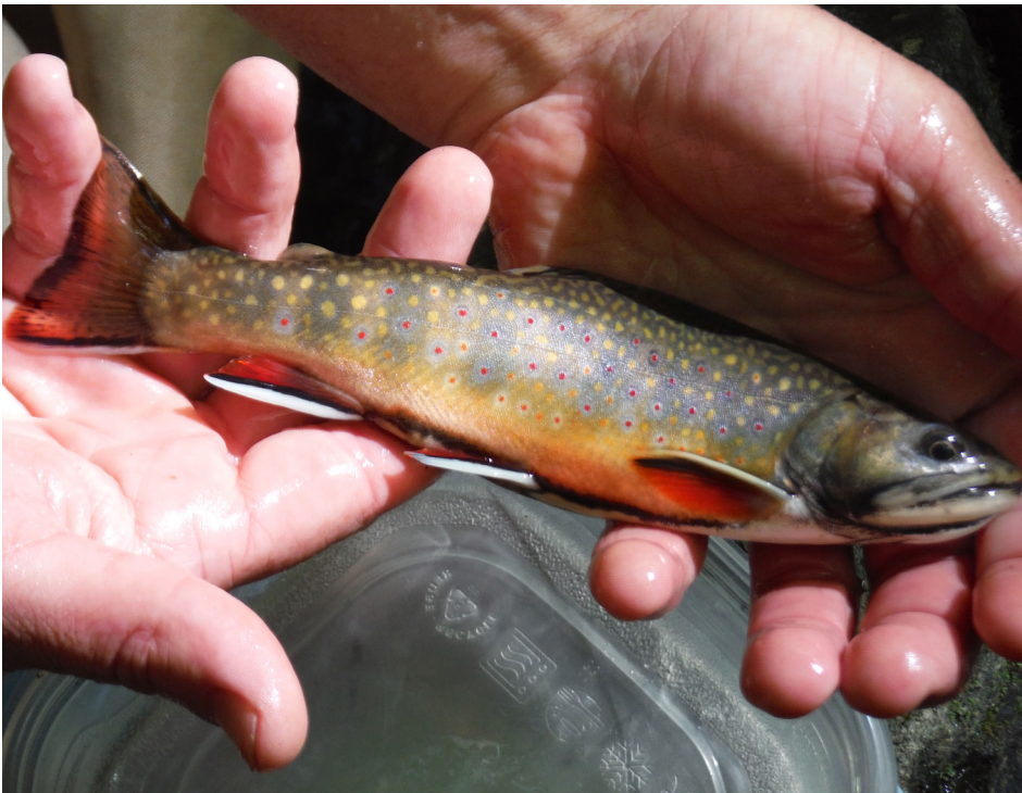
Trail cameras allowed biologists to obtain information on angler use and angler demographics on wild trout waters so they could make decisions on how to best manage wild trout resources and enhance angler satisfaction when fishing these resources.

Visit www.ncwildlife.org/trout for information on trout fishing in North Carolina.