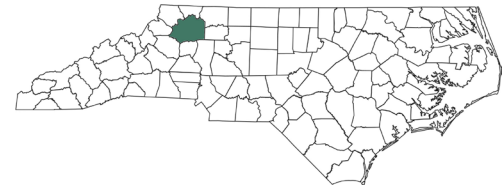
Trail cameras were installed on trout streams in Wilkes County.