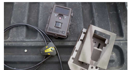
Biologists set up trail cameras like the one above in trees along trout streams.