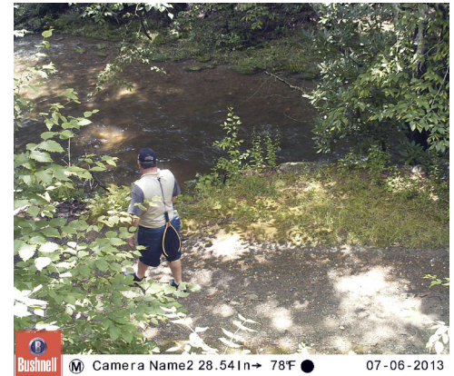
Cameras were set to capture images of anything walking along the access trail.