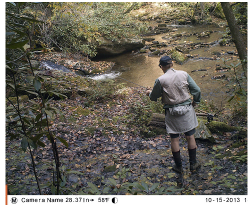
Anglers were typically easy to identify — fishing rod, fishing vest, waders, wading boots.