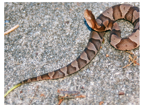
Juvenile copperhead with yellow-tipped tail.

Several captives have lived well over 20 years, and one lived to be over 30. Very few survive for nearly that long in the wild.