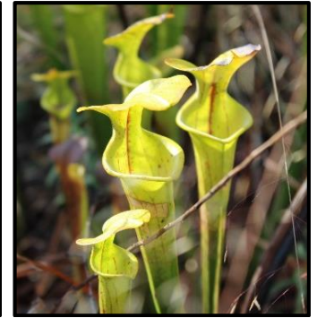
Yellow pitcher plants