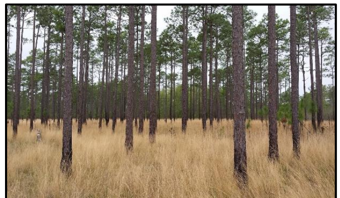
RCW habitat, Pender County, NC.

RCWs require mature pine trees covering at least 75 acres for nesting and finding food. They prefer pine forests that are open and park-like with a large amount of natural grass growing underneath.