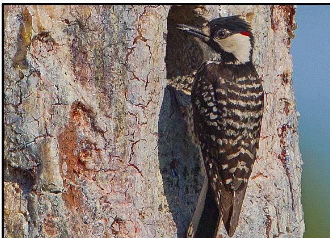
Male RCW.