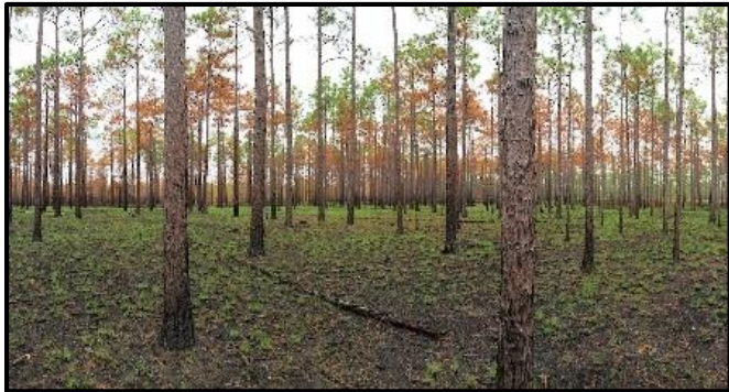
Regenerating understory after a controlled burn, Pender County, NC.

In the absence of fire, an open pine forest will transform into a dense pine-hardwood forest and RCWs will abandon the site. Pine stands that are currently unsuitable for RCWs can be restored to a suitable condition using proper habitat management.