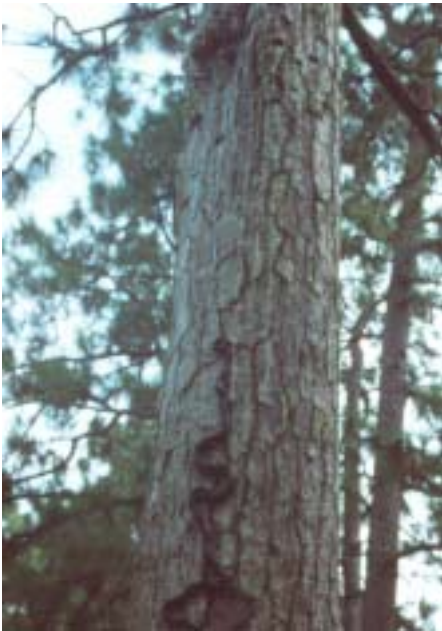
Top: female RCW working on resin well; Derrick Hamrick; bottom: black rat snake climbing RCW cavity tree; Richard N. Conner, USFS

outbreaks such as the southern pine beetle. RCWs use this increased resin flow for cavity defense by chipping holes, called 'resin wells', above and around the entrance to the cavity as a defense against predators. Rat snakes, skillful at climbing trees, are the main predators of RCW nests. Resin flow produced by the wells creates a physical and chemical barrier that impedes the snake's movement up the tree. The birds also scale the outer bark off the tree above and below the cavity entrance, exposing sapwood around the cavity entrance forming a 'plate' around the cavity. Resin flowing from the