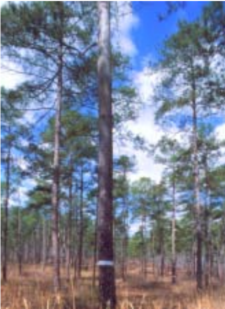
Top: completed, very active cavity (note the large resin wells, thick resin flow and plate formation, indicating a cavity that has been in use for years); Bob Hooper, USFS; middle: RCW cluster in longleaf pine forest; Bob Hooper, USFS; bottom: RCW cluster in shortleaf pine/loblolly pine forest; Phillip Jordon