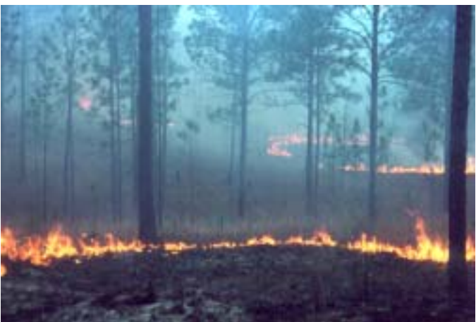
Top: lightning-ignited wildfire in longleaf pine forest; Ralph Costa, USFWS; bottom: slow moving ground fire in longleaf pine forest likely typical of 'historic' natural and human ignited fires; D. Craig Rudolph, USFS

strikes, which occur more frequently in the southeast than anywhere else in North America. Most fires started by lightning strikes occur in the spring and summer growing season, when thunderstorms are more prevalent. Native Americans and later European settlers used fire to clear land and improve hunting grounds. However much of this burning was accomplished during the winter, the non-growing season. Frequent fires created an open forest, with large pines, little to no mid-story, and a diverse herbaceous groundcover; described by many 19th century naturalists as 'park-like' because they could easily ride horses and wagons across the land. Many of the groundcover plant species show