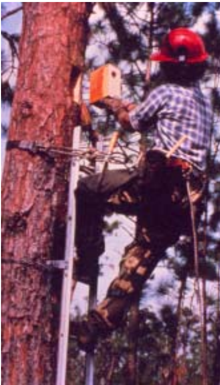
Top: subadult female and male in preparation for translocation to a recruitment cluster; bottom: wildlife biologist installing artificial cavity insert

saving critically small populations in danger of 'extirpation' or disappearing; developing a better spatial arrangement of groups to reduce isolation; introducing birds to suitable habitat; and increasing genetic diversity in critically small populations. Typically, two types of translocations are conducted: a female juvenile is moved to a solitary male group; and an unrelated male and female juvenile are moved to a 'recruitment' cluster in hopes of establishing a new group. Recruitment clusters are established by installing artificial cavities in unoccupied but suitable